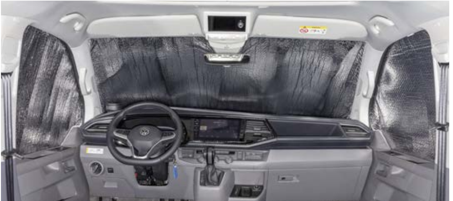
ISOLITE Inside is available for all cabin windows of VW T6.1/T6/T5 Multivan and California Beach. Fixation with hook-and-loop fastener.