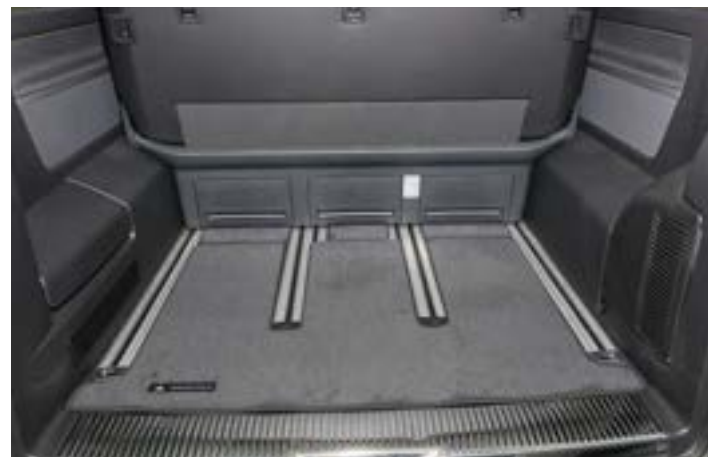
Velour carpet for the boot of VW California Beach and Multivan.

Small picture above: fixation with a firm hook-and-loop strap. Design: "Palladium" or "Titanium Black". Made in Germany.