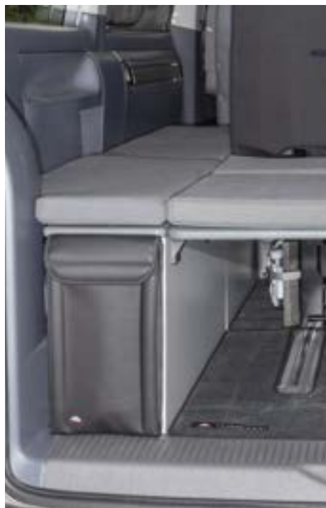
Utility for the back of the bedding box with one storage pocket.