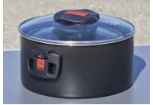
The cooking set consists of 6 parts: pot Ø 25 cm, 5 l with top; pot Ø 21 cm, 2.8 l with top; pot Ø 17 cm, 1.5 l with top. Made in Italy.