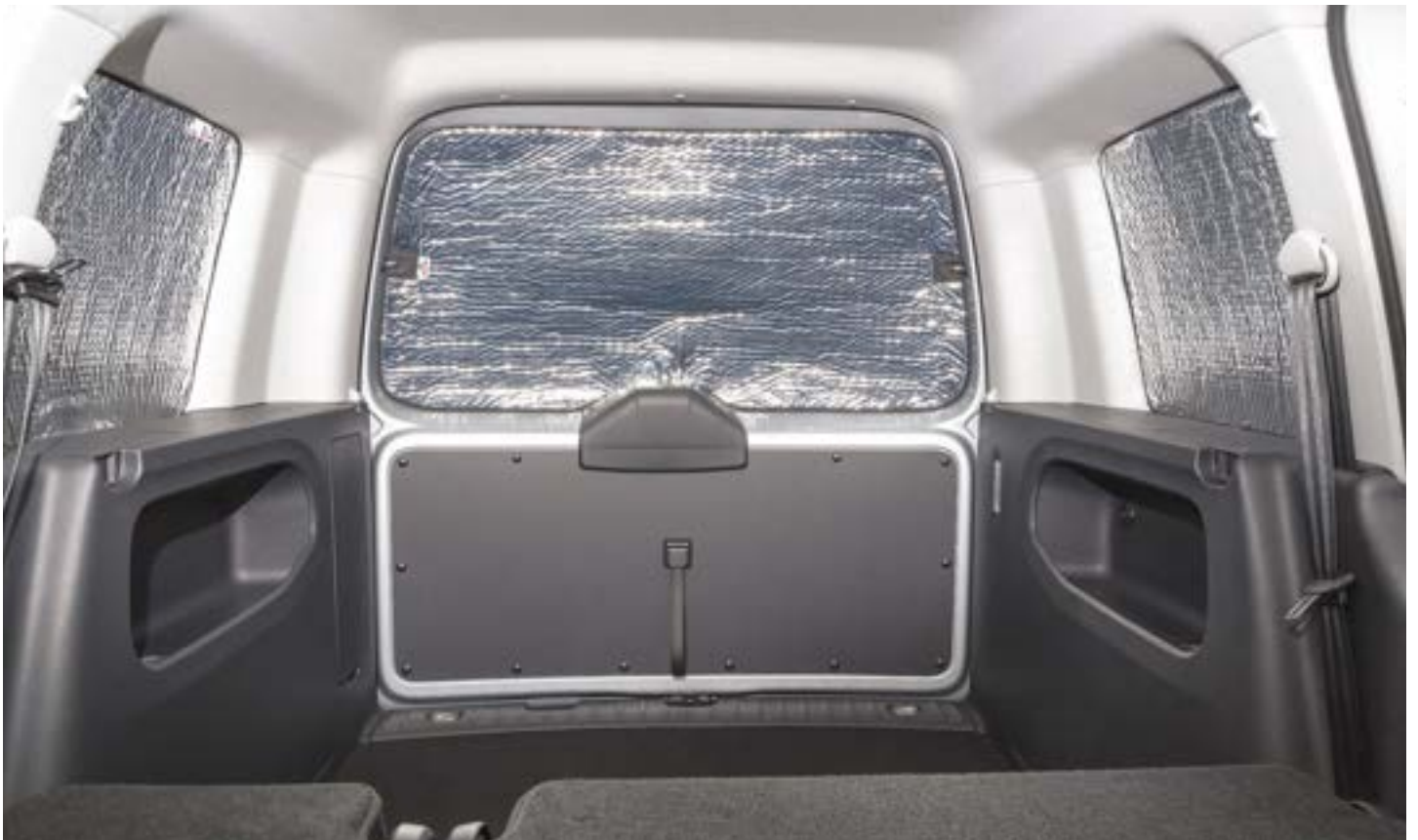
ISOLITE Inside for the tailgate window of VW Caddy. Fixation with hook-and-loop fastener.