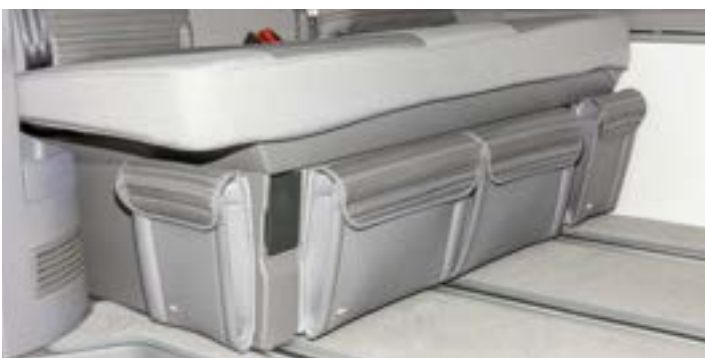
Utilities for the bedding box: sideways (for the right side); with two pockets for the front of the bedding box; for its front on the left side.