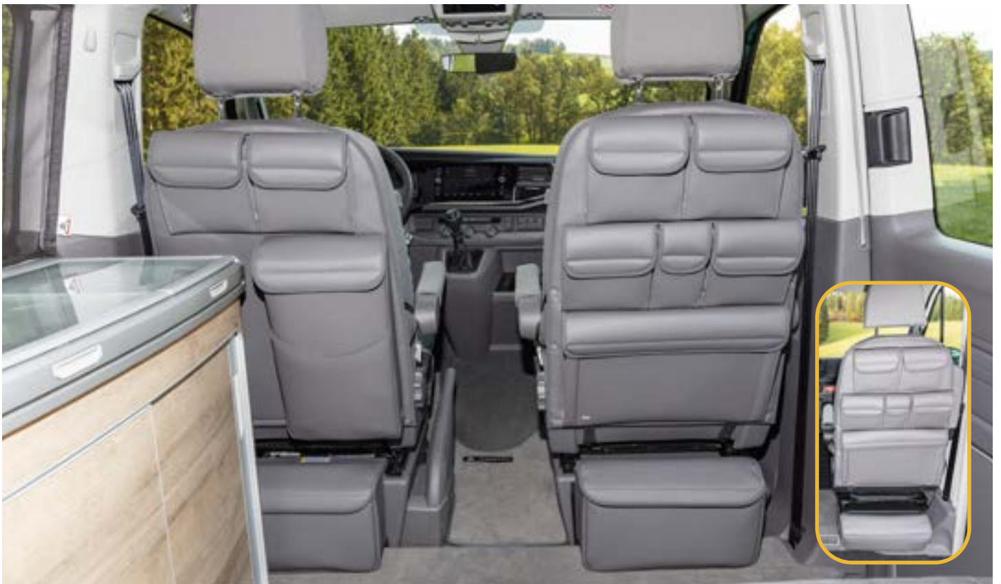
MULTIBOX CarryBag: Attachment on the back of all driver's cabin seat consoles of VW T6.1/T6/T5 and Grand California (right picture).