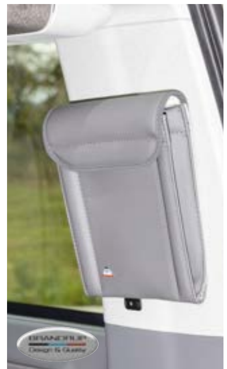
The Utility for the D-pillar is identical with the Utility for the bedding box, right side.