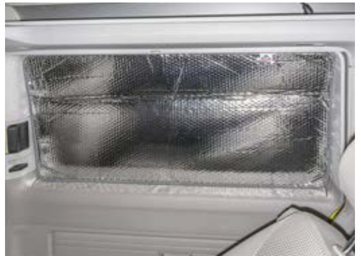
ISOLITE Inside for the single-glazed passenger cabin windows on the left and passenger cabin windows on the right.