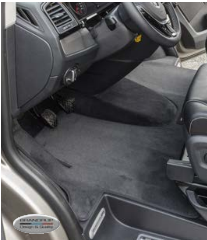
One-piece carpet for the driver's cabin: easy to clean!

Velour carpets for VW T6.1/T6/T5 Multivan are precisely designed, very hard-wearing and can be easily cleaned with a Hoover, as sand, clods of earth and dust can hardly get into the material. Below it is covered with an anti-slip material. The trays of the 3-seater bench have to be taken out and put up onto the pullout rails. Velour carpets are available for all VW T6.1 Multivan and California Beach Tour with one or two sliding doors as well as VW T6.1/T6/T5 California Beach with 3-seater bench and for Multivan Startline as from 2010.