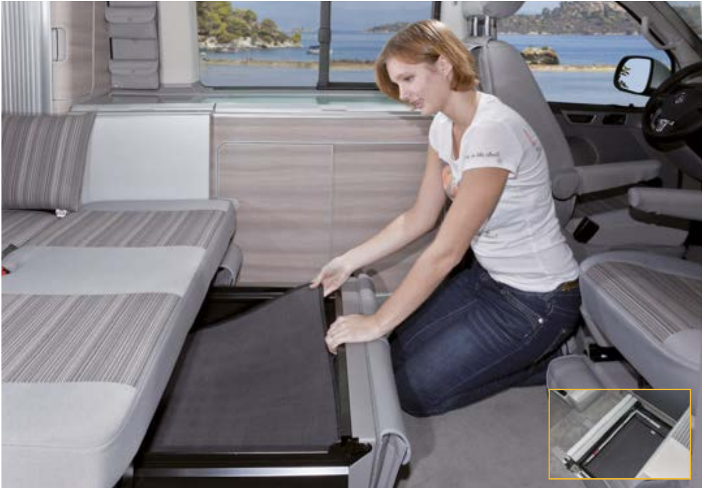
Noise damming mat and set T6.1/T6/T5 California: ideal to reduce noise inside the drawer beneath the bed (2-seater bench): deposited items do no longer "rattle" and are better protected. The awning crank can still be clipped in. The noise damming mat (floor) is simply placed into the drawer. The noise damming set (side parts) is attached with hook-and-loop fastener.