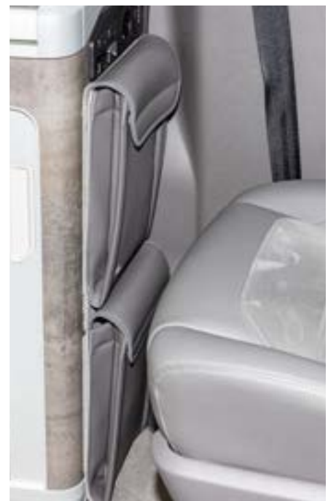
Utility with two pockets for the side of the scullery. Design: "Leather Palladium".