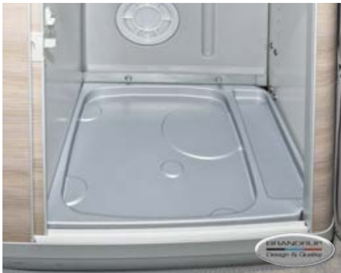
Protection tray. Design: Metallic Silver Grey. Made in Germany.