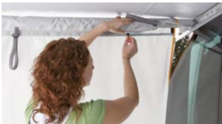
Simple attachment with stainless steel zipper.