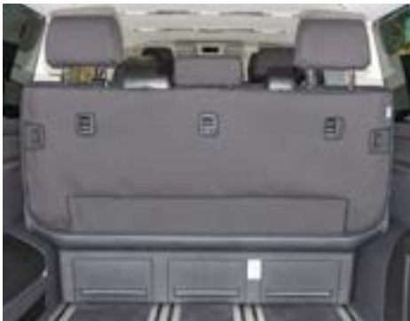
Second Skin for 3-seater bench with gap for 3 ISOFIX anchorage points in the backrest.

Second Skin seat covers are suitable for the seats (including "ArtVelours") of the VW T6.1 models.