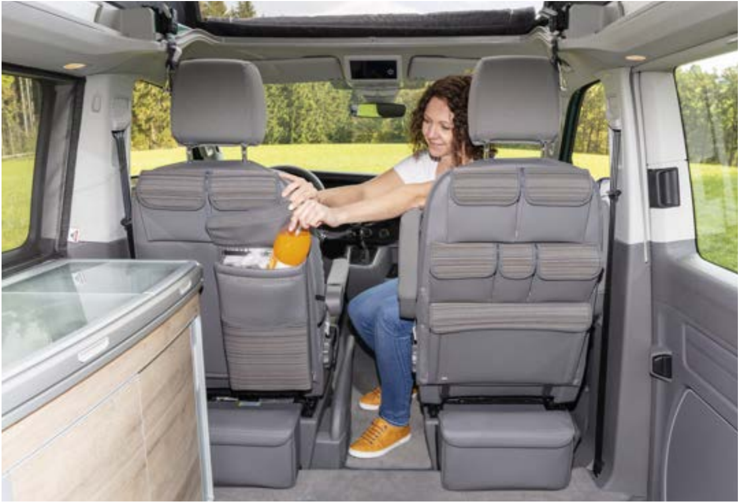
Utility with MULTIBOX for the left seat of the driver's cabin: insulation box + invisible rubbish bin + storage room. The MULTIBOX has the same quality as an insulation bag: its interior is lined with insulating and shock resistant material. It even offers enough space for 2 litre bottles. If you need a rubbish bin, simply insert a standard 20 litre rubbish bag with handles to the holders inside. Right side: the Utility for the passenger seat offers a lot of storage room. Design: "Mixed Dots/Leather Palladium".