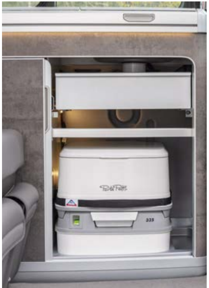
Protection tray with "Porta Potti 335" and loop handle.