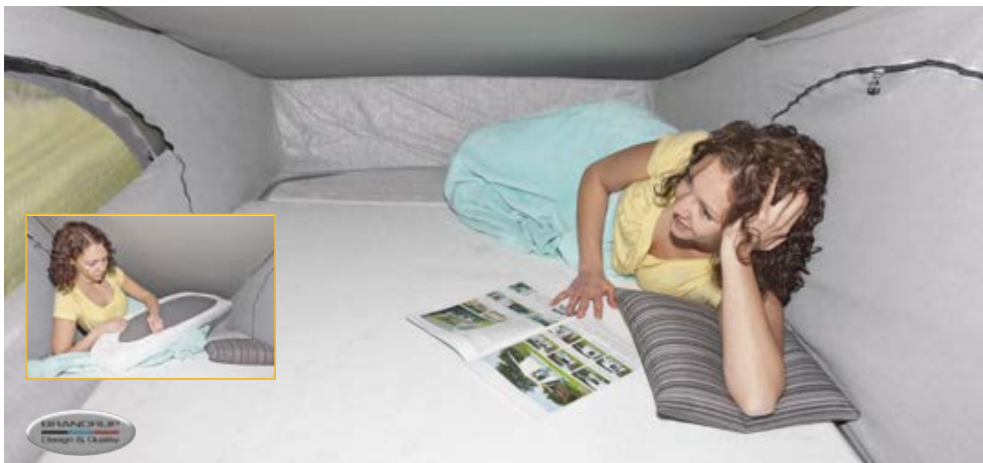
The iXTEND fitted sheets for the serial mattress in the pop-up roof of the VW T6/T5 California models consist of two pieces.