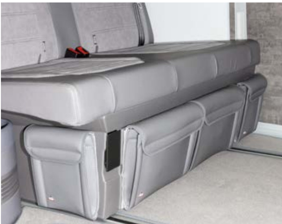
Utilities for the bedding box: sideways (for the right side); with two pockets for the front of the bedding box; for its front on the left side. Design: "Leather Palladium".