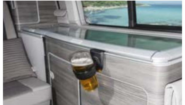
The beer glass fits into the California cup holder.