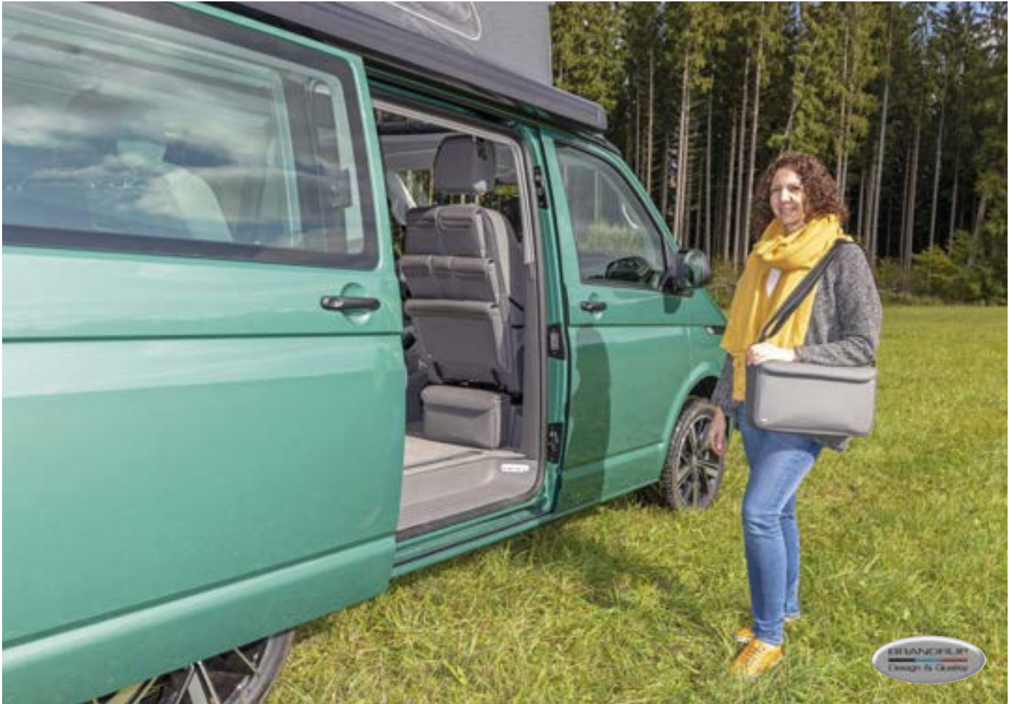
MULTIBOX CarryBag: The elegant, insulating bag in the original vehicle design can also be carried comfortably.