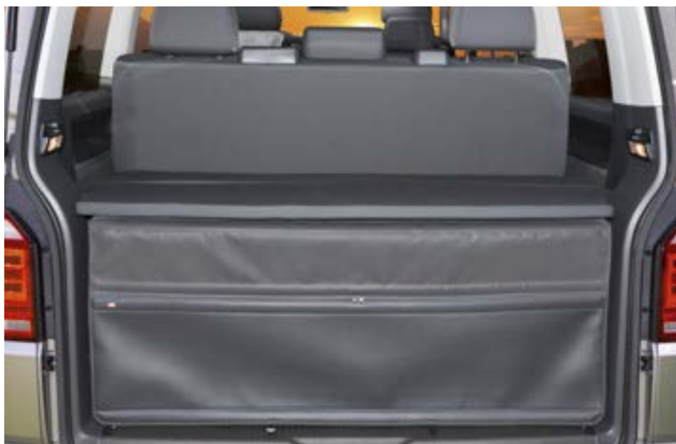
VW T6.1/T6/T5 Beach/Multivan with VW-Multiflexboard in "Palladium"/"Titanium Black"