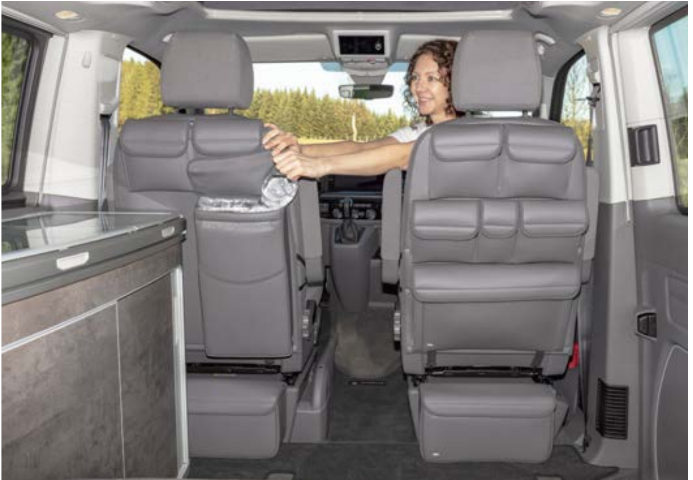
Utility with MULTIBOX for the left seat of the driver's cabin: insulation box + invisible rubbish bin + storage room. The MULTIBOX has the same quality as an insulation bag: its interior is lined with insulating and shock resistant material. It even offers enough space for 2 litre bottles. If you need a rubbish bin, simply insert a standard 20 litre rubbish bag with handles to the holders inside. Right side: the Utility for the passenger seat offers a lot of storage room.