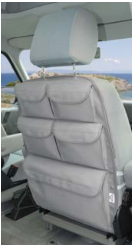
Utility for driver's and passenger's seats, also fit all VW T4 Multivan models. Design: "Palladium".