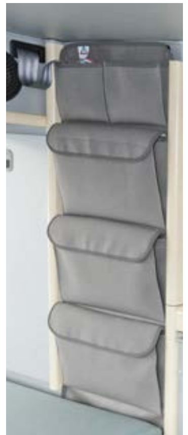
Utility for the wardrobe, centre: the safety belt of the bench can be stored in the upper bag.

Original Utilities for all VW T4 California models in design VW T6.1 "Palladium" offer a lot of storage space, a clever disposition and create a lively, homelike atmosphere. All bag flaps have a continuous hook-and-loop fastener. The Utility for the rear end of the wardrobe has a removable multipurpose bag with zipper. The Utility for the roof storage box not only offers four large bags but also creates an appealing atmosphere. The Utilities are attached to the furniture by snap fasteners and hook-and-loop fastener; the frieze band for the furniture side is self-adhesive.