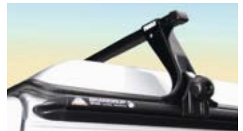
Safe and easy fixing for carriers with supports for rain water gutter. Can be removed easily when the roof has to be opened.