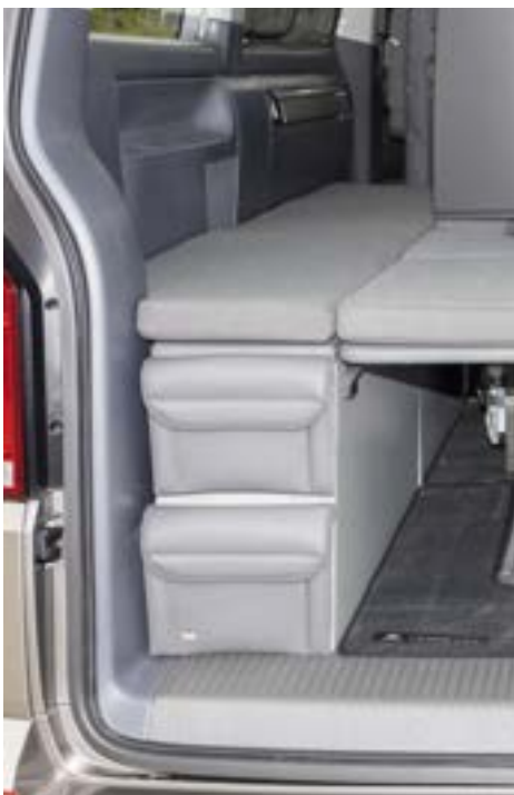
Utility for the back of the bedding box with two storage pockets.

The Original Utilities offer a lot of additional storage space, a cleverly devised disposition and create an appealing atmosphere. The Utilities are made of the original premium quality Volkswagen materials. All artificial leather surfaces are easy to wipe clean. All Utilities for VW T6.1/T6 Beach with 2-seater bench are available in the design: "Leather Palladium", "Leather Titanium Black", "Mixed Dots/Palladium". MULTIBOX CarryBag insulation bag on the seat consoles, cf. pages 10-11. Made in Germany.