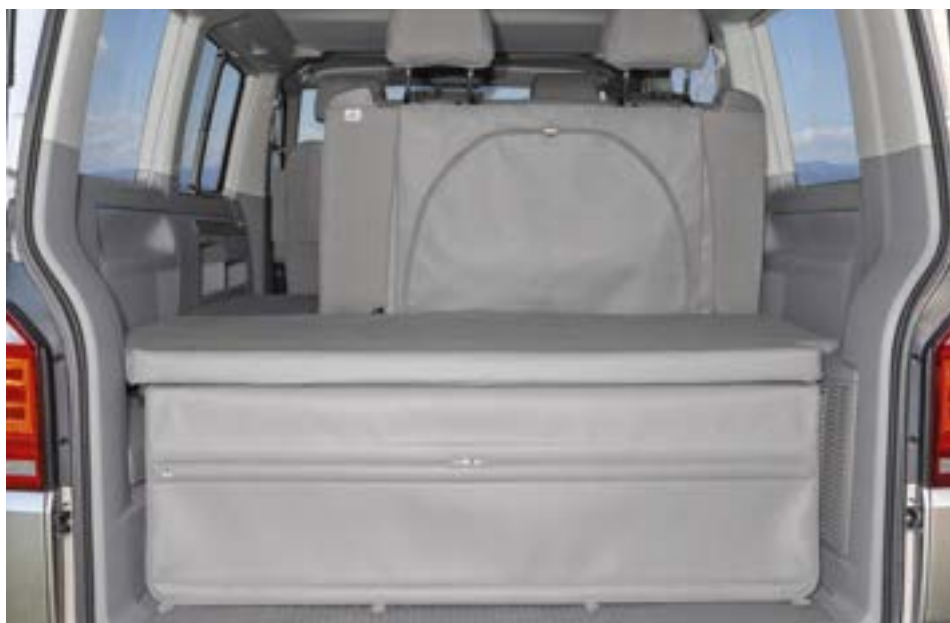
FLEXBAG Stern for VW T6/T5 California Beach with 2-seater bench. Design: "Palladium".