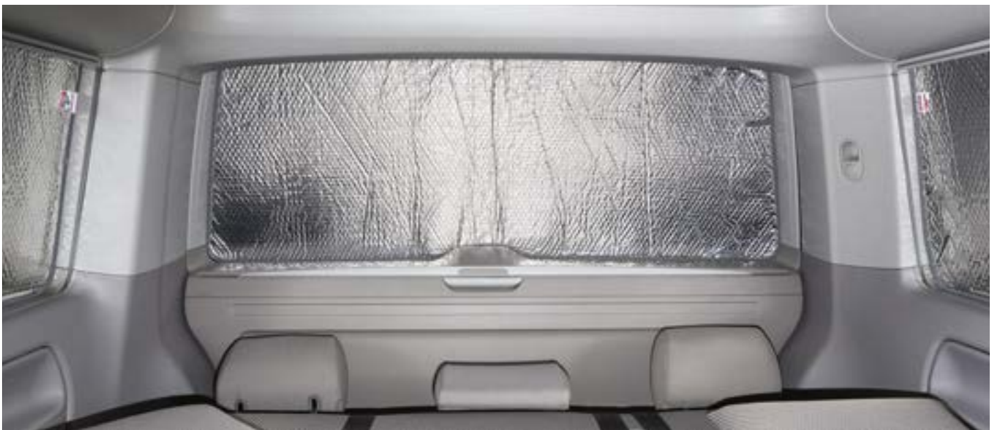
ISOLITE Inside for the windows between C-D-pillar as well as for the tailgate window.