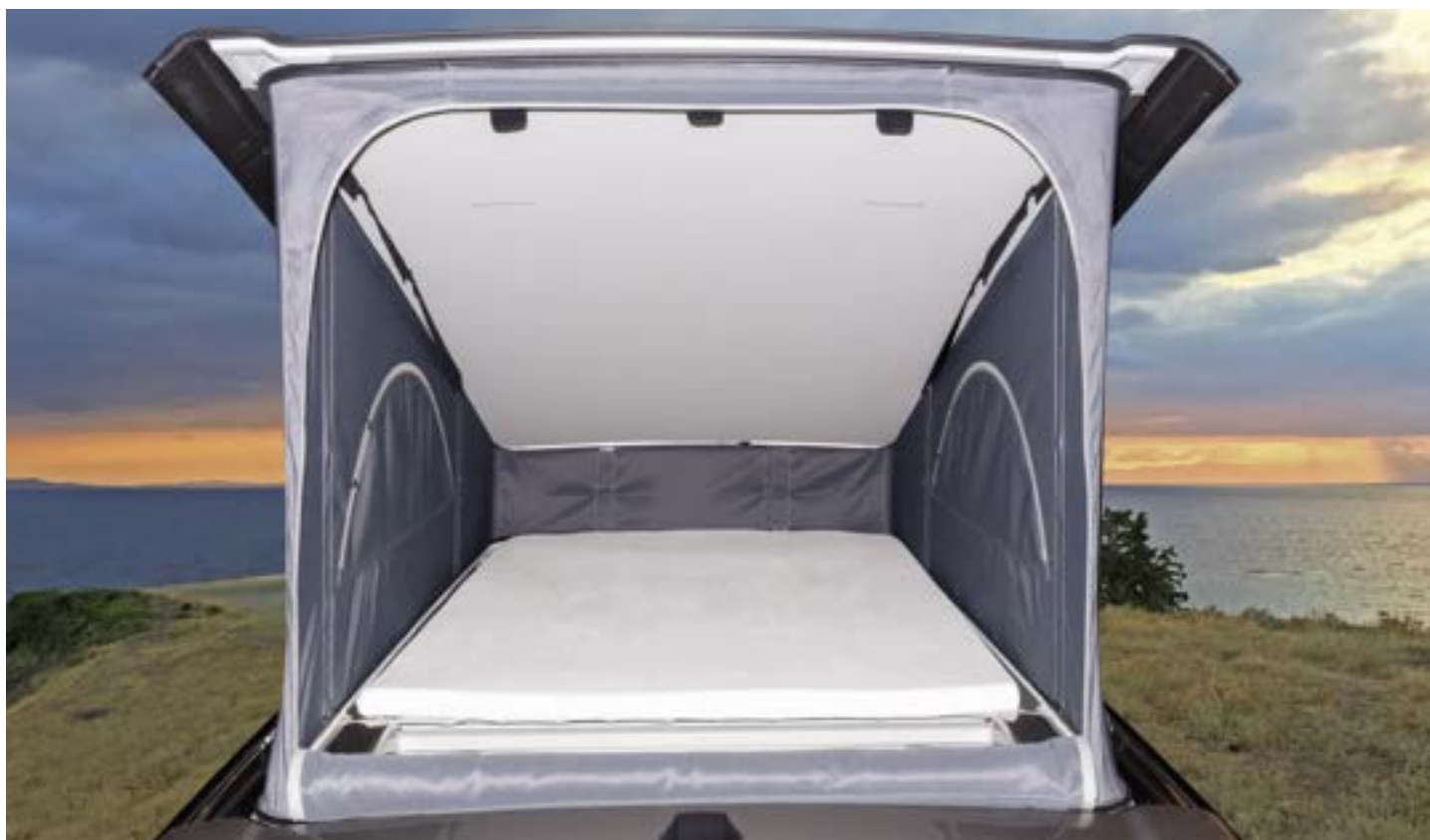
The specially designed iXTEND fitted sheets for the original mattress in the pop-up roof of VW T6.1 California fit precisely. Versions: Nicki-plush and Single-Jersey.