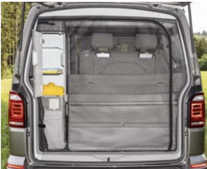
The new FLYOUT for the tailgate opening guarantees fast access to the storage trays of the rear wardrobe.