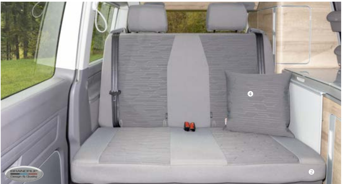
Second Skin for VW T6.1 California Ocean/Coast in the design "Circuit/ Palladium" are also available for all respective VW T6 models.