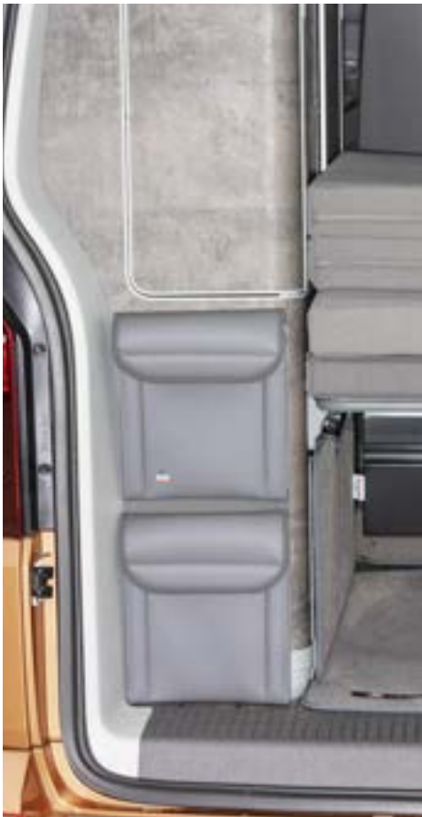
The Utility for the back of the wardrobe has two storage pockets.

The Utility for the "cupboard window" has two storage pockets: the lower bag is padded to suppress noises and has loops made of elastic band for four customary spice glasses (not included in the scope of delivery). The triple back with insulation inlay is fixed to the window with a special hook-and-loop fastener; the Utility can be optionally removed. Design: "Leather Palladium".