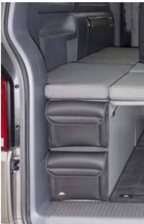
Utility for the back of the bedding box with two storage pockets.

The MULTIBOX CarryBag (on the consoles of driver's and passenger's seat cf. pages 10-11) is available in the design: "Leather Palladium" and "Leather Titanium Black".