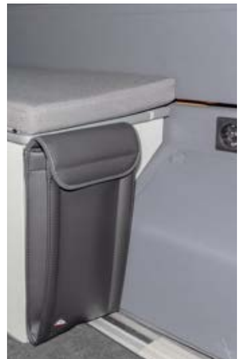
Utility for the front of the bedding box in the design "Leather Titanium Black".