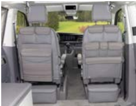
Right picture: The Utility for the D-pillar is attached with hook-and-loop fastener.