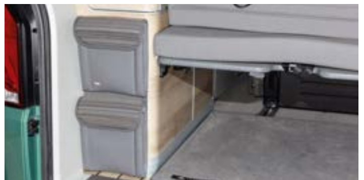
The practical Utilities with two pockets for the back of the wardrobe.