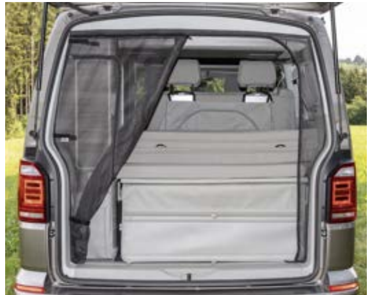
The mosquito net can be rolled up partially, halfway or completely: very practical for camping or in daily life!