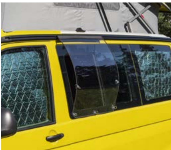
AIRSCREEN VW T6.1/T6/T5: fresh air also in the rain.

The invisible and elegant rain water protection for the left sliding window.