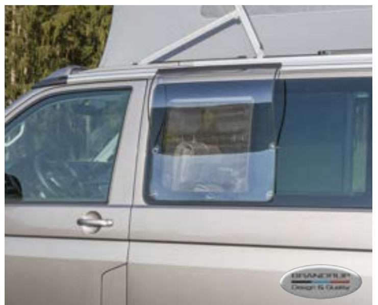
AIRSCREEN VW T6.1/T6/T5 is made of high quality polycarbonate plates ("Makrolon"®).

During rain, it is possible to adjust it by two vertical rows of suction cups for optimal ventilation.