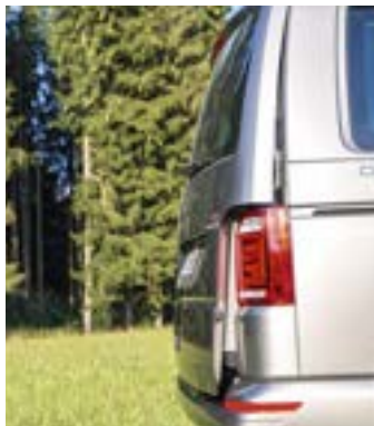
AIR-SAFE for all tailgates with or without closing aid.