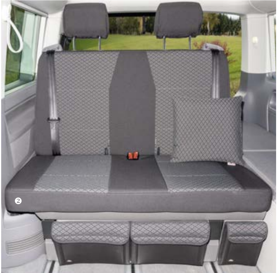
Second Skin for the 2-seater bench of VW T6.1 in the design "Quadratic/Titanium Black" also fits all VW T6/T5 California Beach.