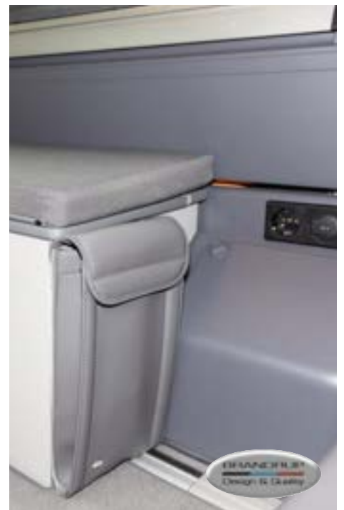
Utility for the front of the bedding box in the design: "Leather Palladium".