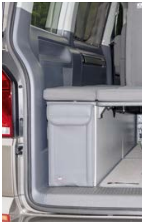
Utility for the back of the bedding box with one storage pocket.