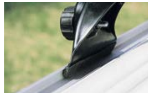
The supports of the carrier is fixed to the side and bottom of the rail, still allowing rain water to flow off easily.

Exclusively made for TOP-RAIL: excellent universal brand roof carriers. They provide less wind resistance and less intrusive noise than usual roof carriers for vehicles without a rain water gutter. For all vehicles with tin roofs the support is approx. 14 cm high and with pop-up roof approx. 20 cm.