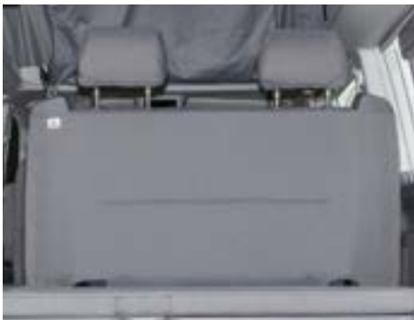
Second Skin backrest of the 2-seater bench with big, zipper-bag.

Second Skin seat covers are suitable for the seats (including "ArtVelours") of the VW T6.1 models.