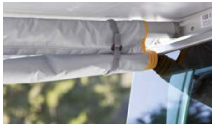
The side panel can be attached to the arm of the awning.